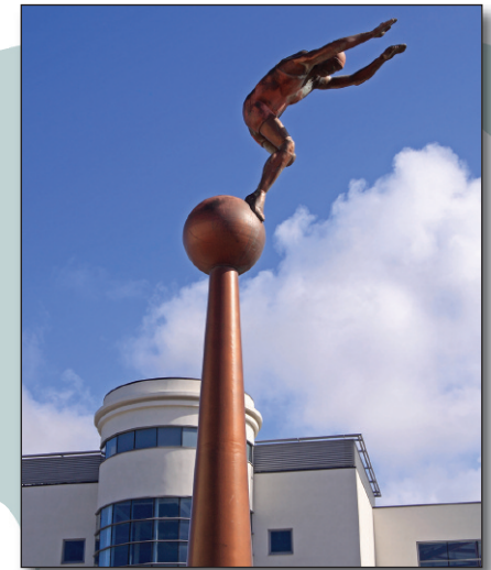
Right: High dive. One of many sculptures along the seafront.