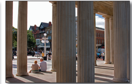
Top right: A couple take a break from shopping, dwarfed by the pillars of the War Memorial.