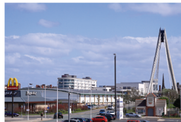
Architectural jumble. Looking back towards the town centre from the beginning of the pier.