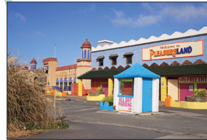
Above: The gaudy exterior of Pleasureland is certainly eye-catching and not what might be expected of genteel Southport.