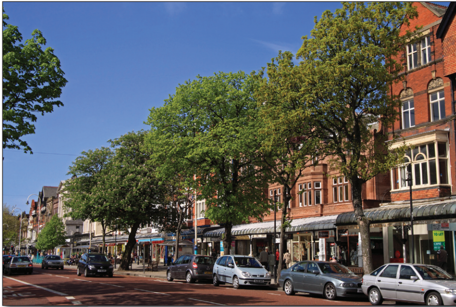
Lord Street. It is often assumed that boulevards were originally a French design, but Southport was equally responsible for developing the idea.